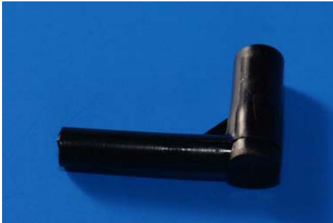
Vacuum Damper Elbow

The RMV is a sealed device, when fitting ensure all connections are firmly made so the system will be closed i.e. no air will be drawn into the engine. On startup the RMV draws 3cc of air and holds this until the engine is stopped, this will not affect the running of your motorcycle.